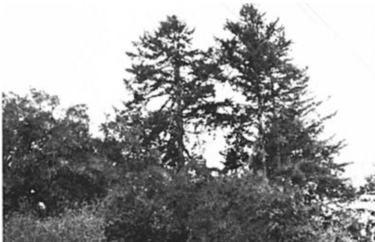
Figure 3. Inverness Park heronry.