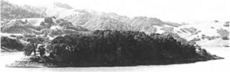
Figure 6. Stafford Lake heronry. The nests were concentrated in trees on the left third of the island.