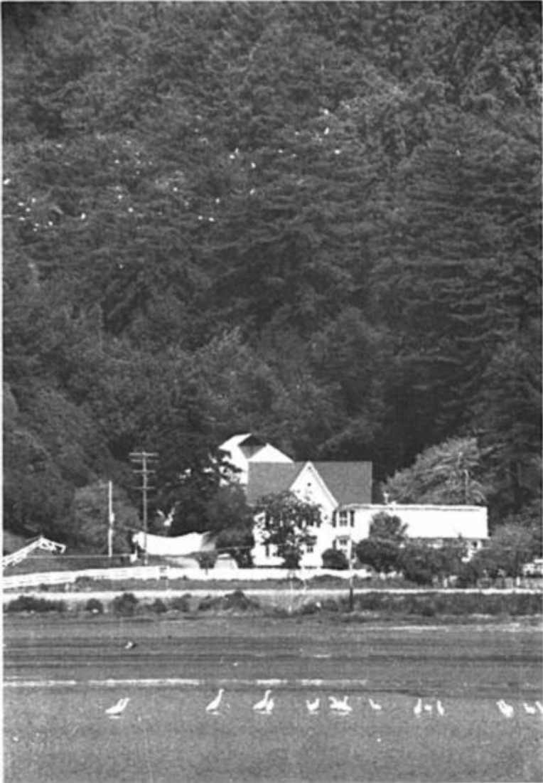
Figure 2. Audubon Canyon Ranch. Egrets are visible occupying nests in trees behind the ranch house.