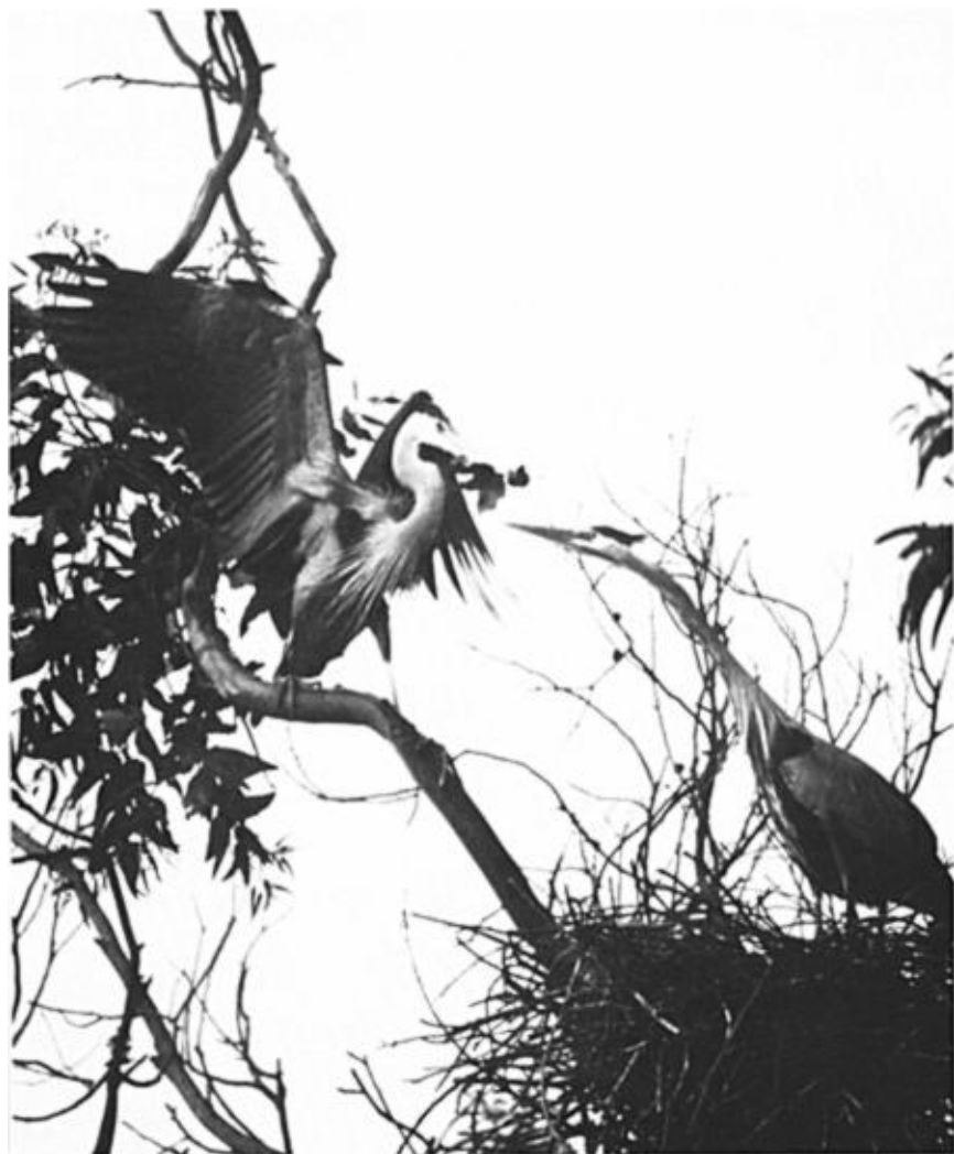
Great Blue Heron presenting a twig to its mate.