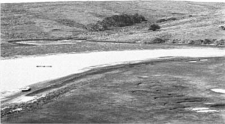
Figure 5. Schooner Bay B. The heron nests were in the small grove of trees on the far side of the bay.

This colony (Figure 6) is on the island in Stafford Lake about 4.5 km west of Novato on South Novato Boulevard (Figure 1). The lake and island are owned by the North Marin Water District. Great Blue Herons nest here in live oak and California Bay ( Umbellularia californica ). They first nested here in 1962 (W.H. Melson pers. comm.) and the colony has become one of the three largest Great Blue Heron colonies in the county (Table 1).