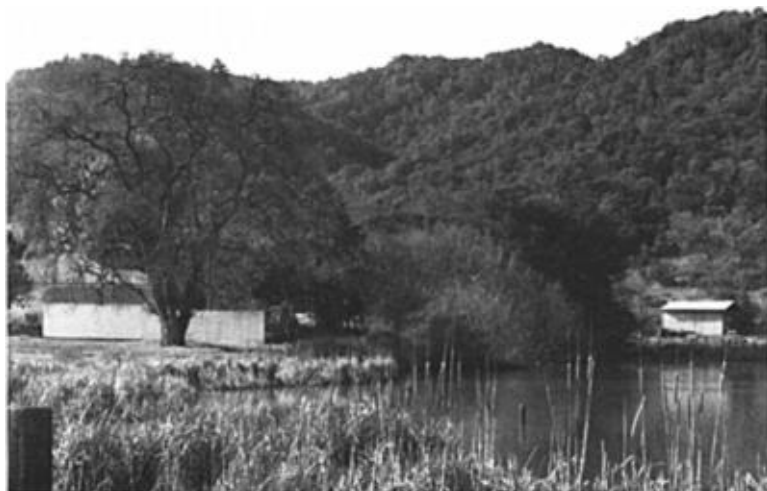
Figure 4. North San Pedro Road heronry. Nests were in the trees behind and to right of the large tree in left foreground.