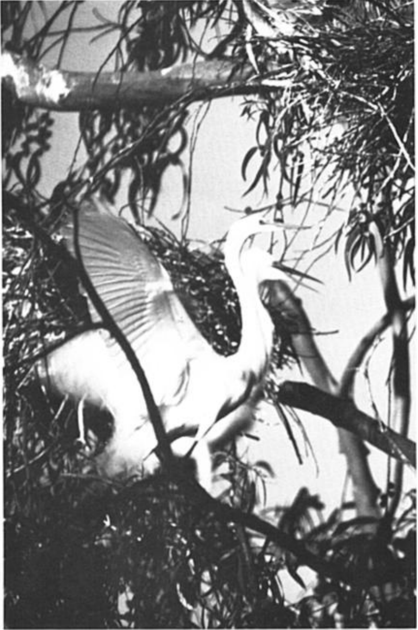
Great Egrets during pair formation.