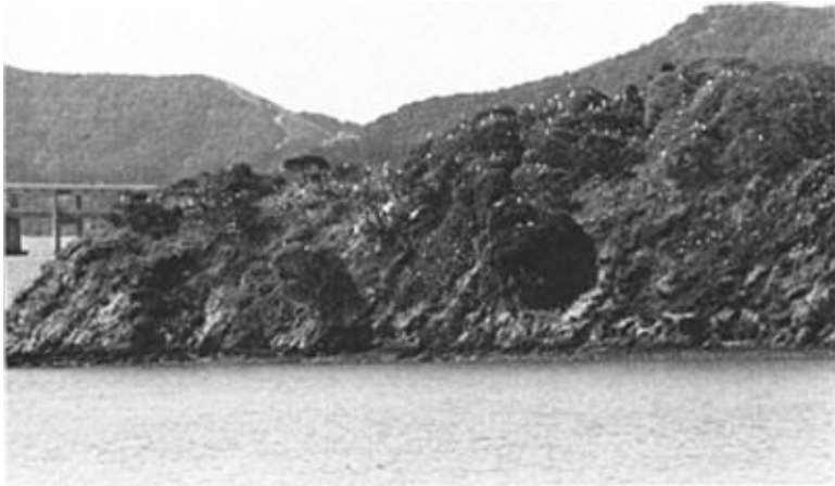
Figure 7. West Marin Island heronry.