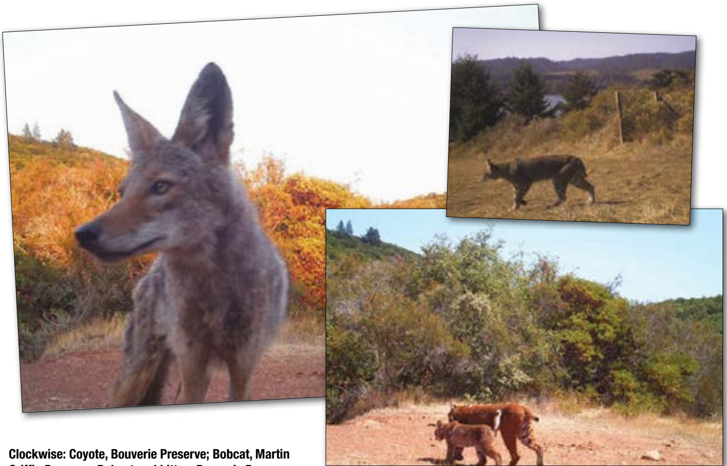
Clockwise: Coyote, Bouverie Preserve; Bobcat, Martin Griffin Preserve; Bobcat and kitten, Bouverie Preserve