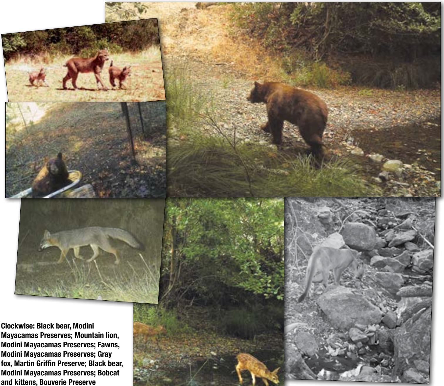
Clockwise: Black bear, Modini Mayacamas Preserves; Mountain lion, Modini Mayacamas Preserves; Fawns, Modini Mayacamas Preserves; Gray fox, Martin Griffin Preserve; Black bear, Modini Mayacamas Preserves; Bobcat and kittens, Bouverie Preserve

Data from these cameras offer valuable insights to ACR science and education staff. Among them are trends in wildlife use and the opportunity for docents to talk with students about how we can share the land. Here are just a few of our favorite shots from the past two years.