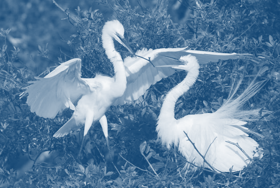
Great Egret twig presentation during nest building.

Preliminary results suggest that relatively few herons and egrets nest in the coastal counties north of Mendocino, compared to the rest of the survey area. However, we suspect that our estimates of nest abundance in these counties are lower than the actual number of nests, given that many potentially suitable nesting areas were difficult to access. The steep, wooded terrain in Trinity and Siskiyou counties, in particular, made surveys difficult. In addition, large amounts of late spring/early summer rainfall interfered with the survey effort, reducing the detectability of nesting birds