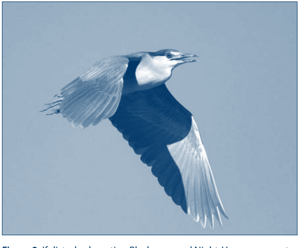
Figure 2. If disturbed, nesting Black-crowned Night-Herons may not choose to nest at other colony sites in the surrounding wetland land-scape but, instead, may move to a distant subregion (Figure 1).