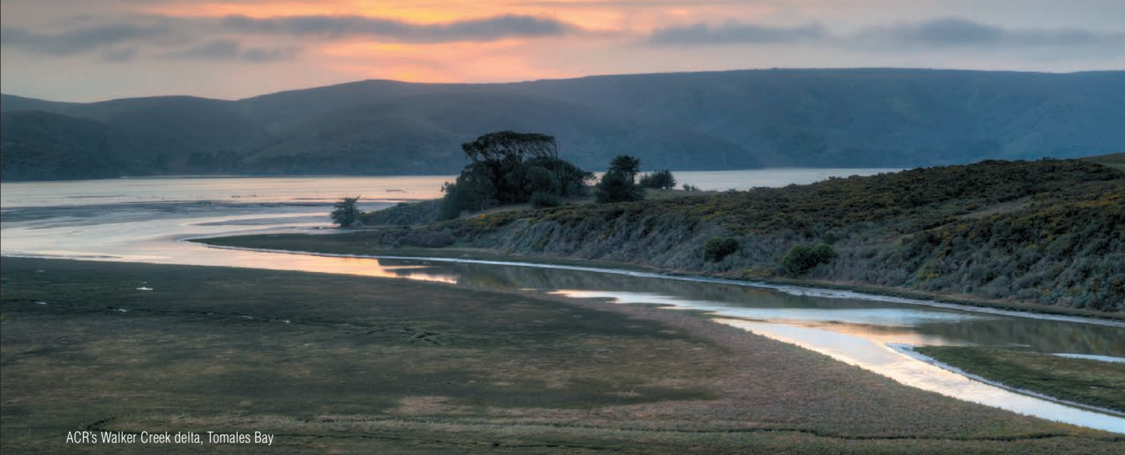
ACR's Walker Creek delta, Tomales Bay