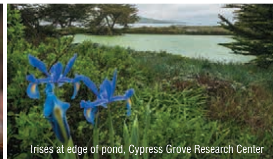
Irises at edge of pond, Cypress Grove Research Center