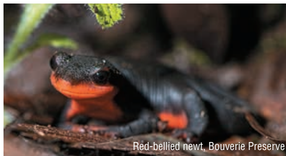
Red-bellied newt, Bouverie Preserve