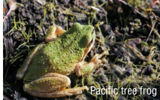
Pacific tree frog