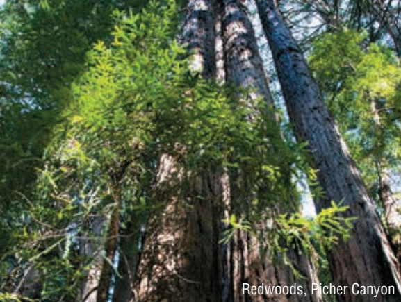
Redwoods, Picher Canyon